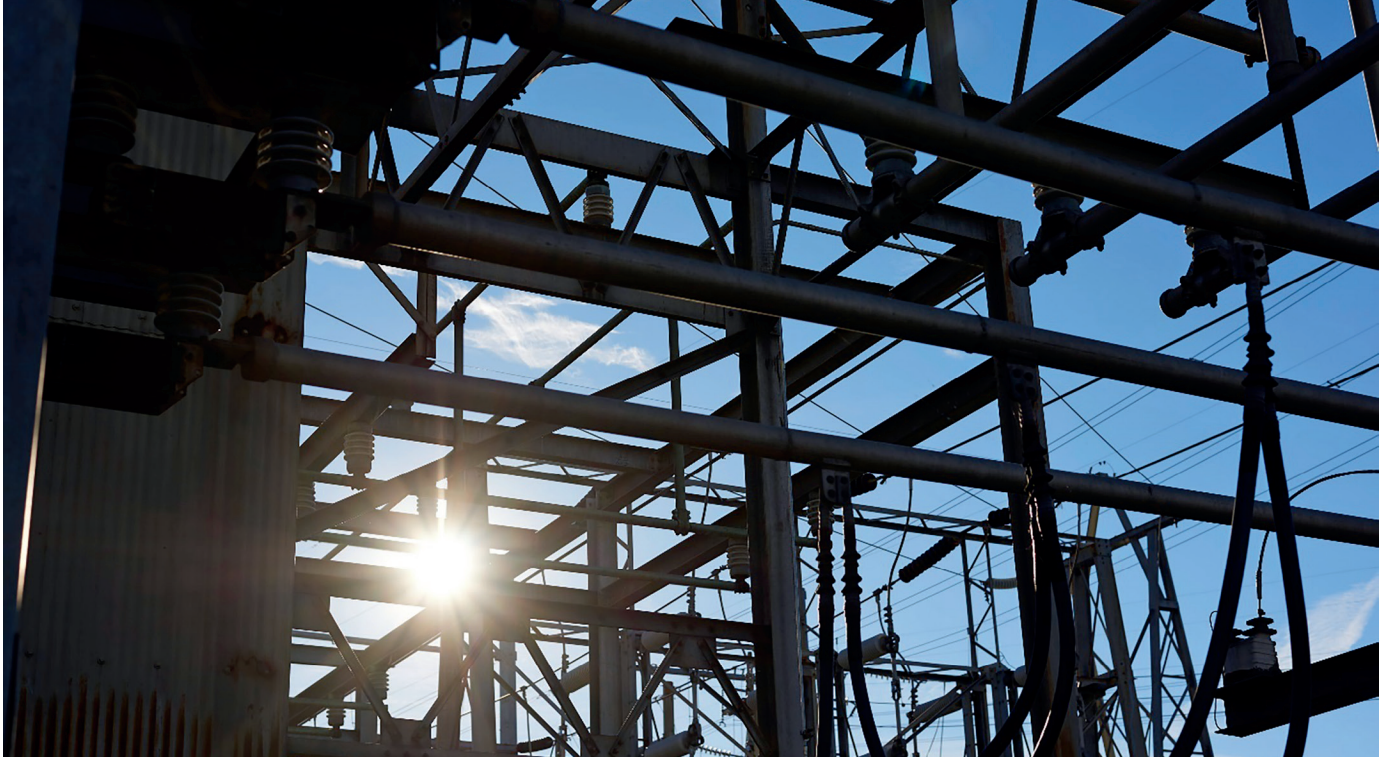
Sample image – not project specific

DOMINION ENERGY is modernizing equipment at Williamsburg Substation as part of our Grid Transformation Plan. This project will replace equipment to support safe, reliable, and affordable electric service for your community.