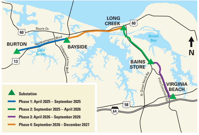
This map is intended to serve as a representation of the project area and is not intended for detailed engineering purposes.

We are dedicated to working safely and courteously in your community. Thank you for your patience while we complete this important reliability project.