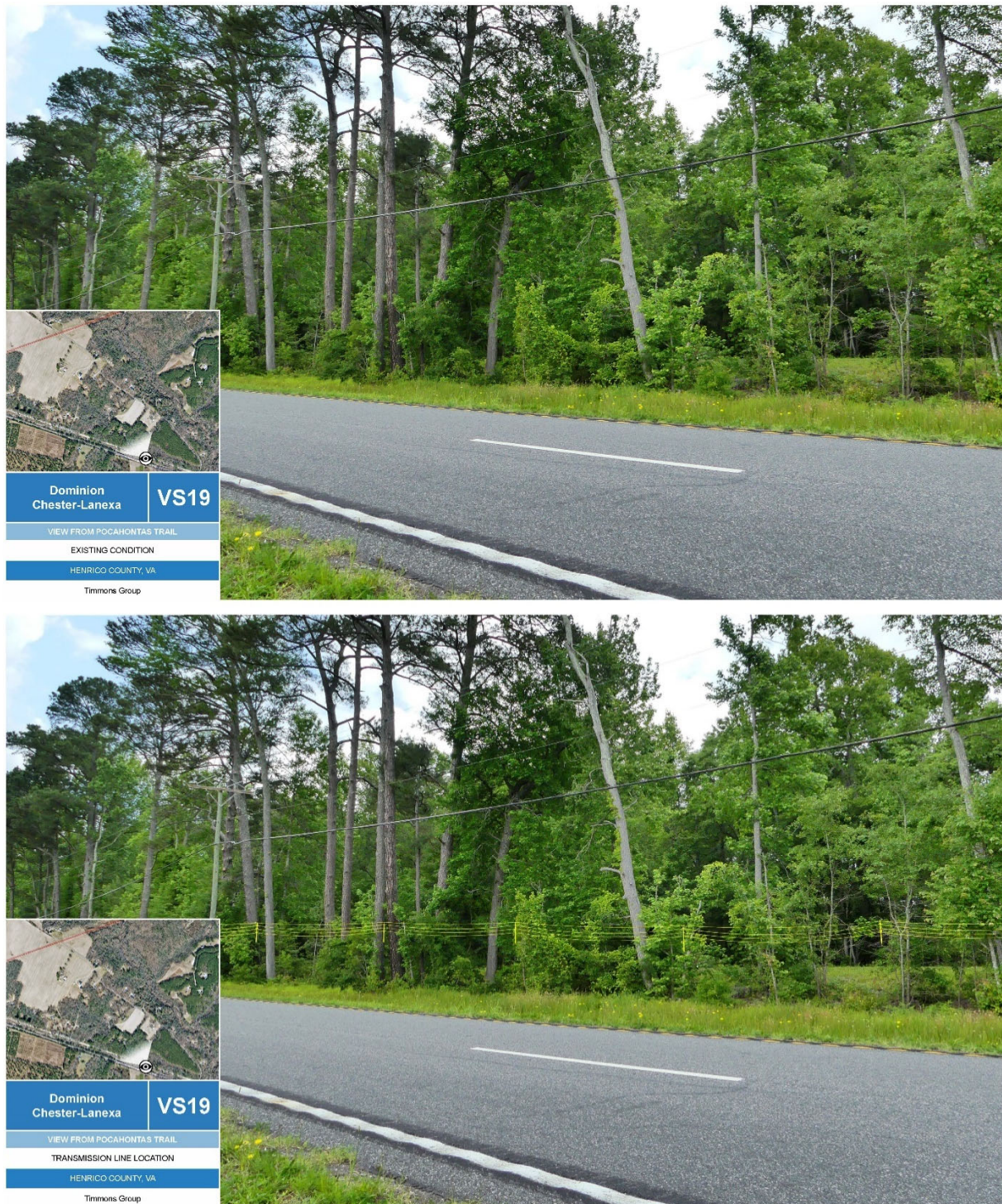
Figure 5-287: Photo Simulation 2 – Existing (above) and proposed (below) view from Route 60 at GW King Boulevard near C&O Railroad , facing northwest. All structures shown in yellow to remain screened behind vegetation.