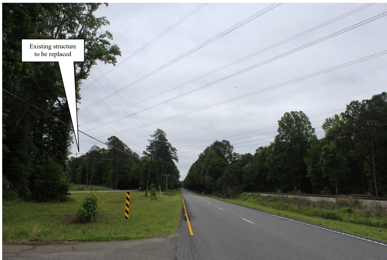
Figure 5-284: Photo location 4 – View from Route 60 at crossing of project ROW and C&O Railroad corridor, facing southeast.