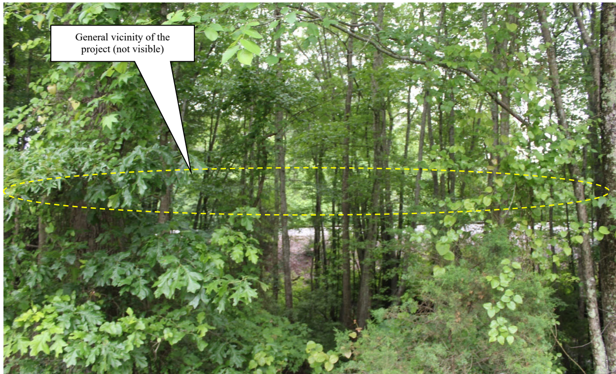
Figure 5-283: Photo location 3 – View from Boulevard Road east of Providence Forge, facing south.