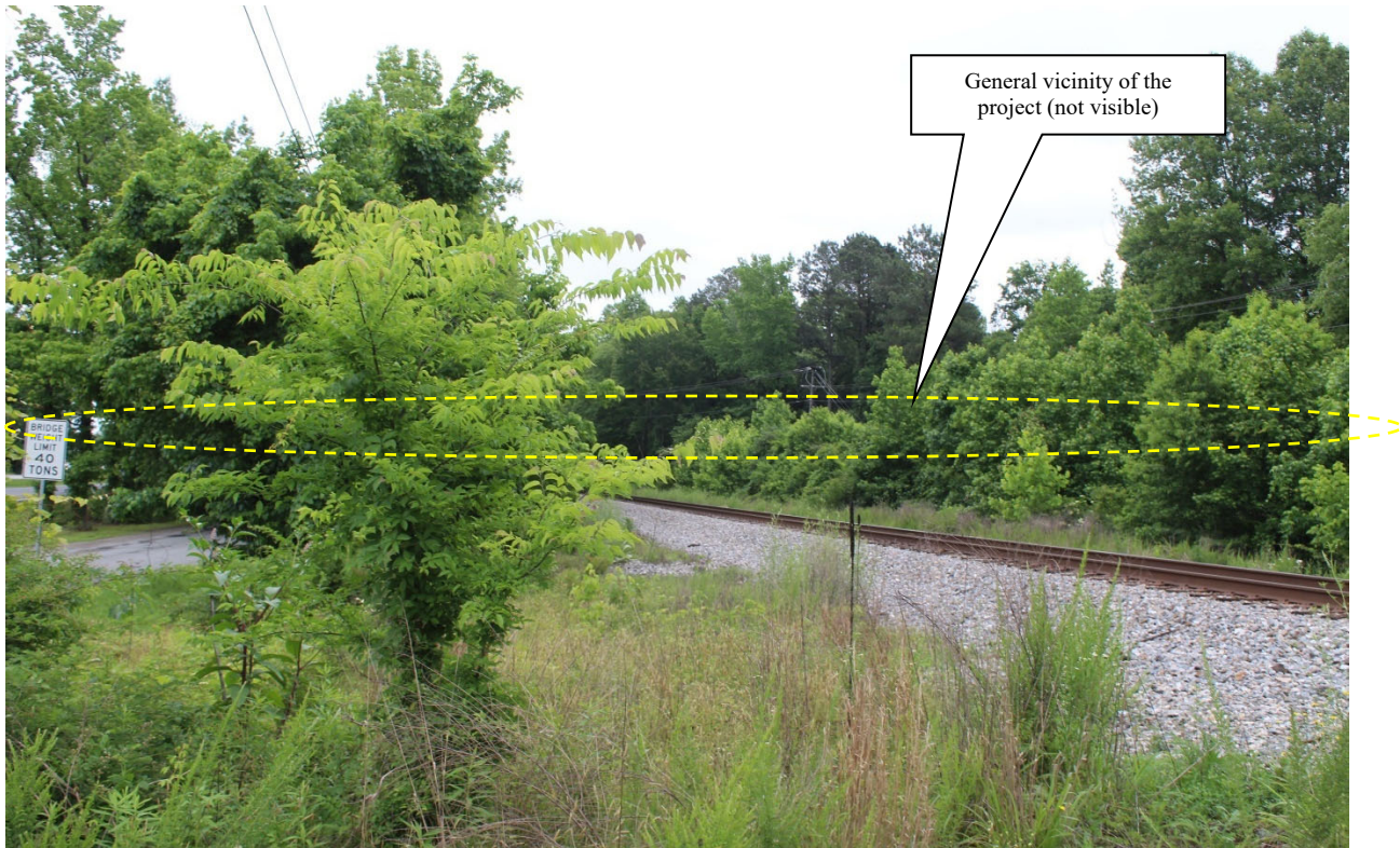
Figure 5-281: Photo location 1- View from C&O Railroad corridor west of Providence Forge, facing southeast.