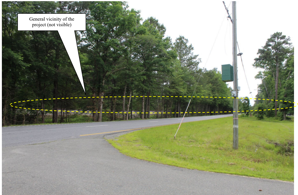
Figure 5-285: Photo location 5 – View from Route 60 at GW King Boulevard, facing west.