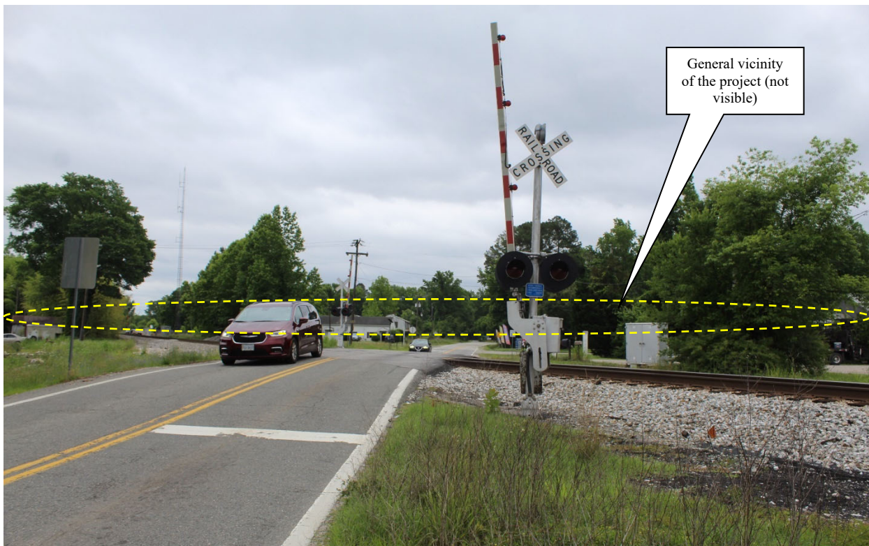
Figure 5-282: Photo location 2 – View from C&O Railroad crossing of Courthouse Road in Providence Forge, facing south.