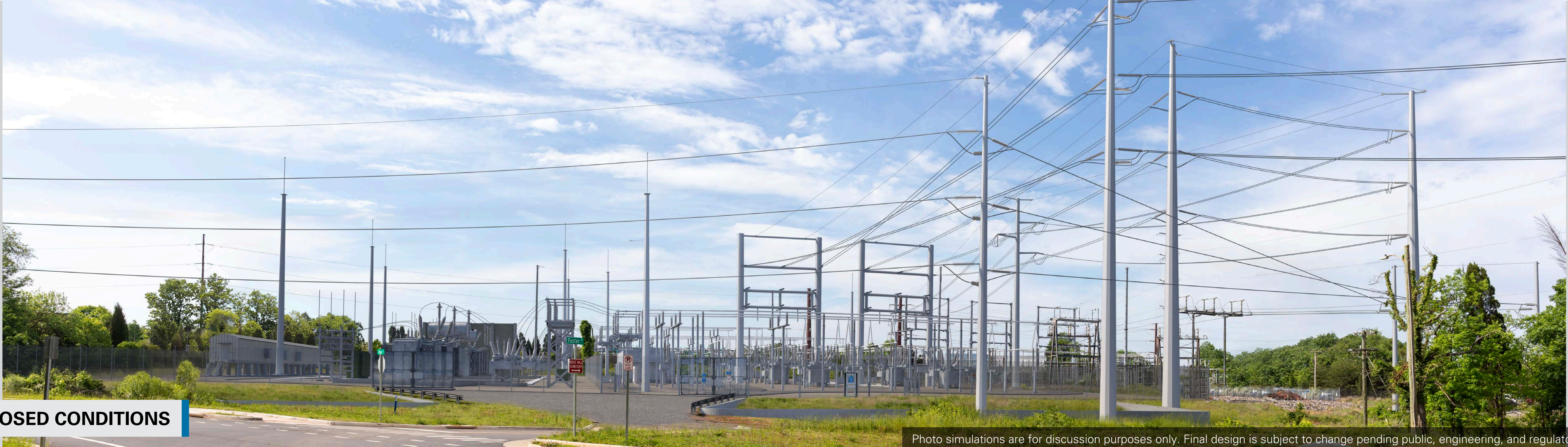
Photo simulations are for discussion purposes only. Final design is subject to change pending public, engineering, and regulatory review.