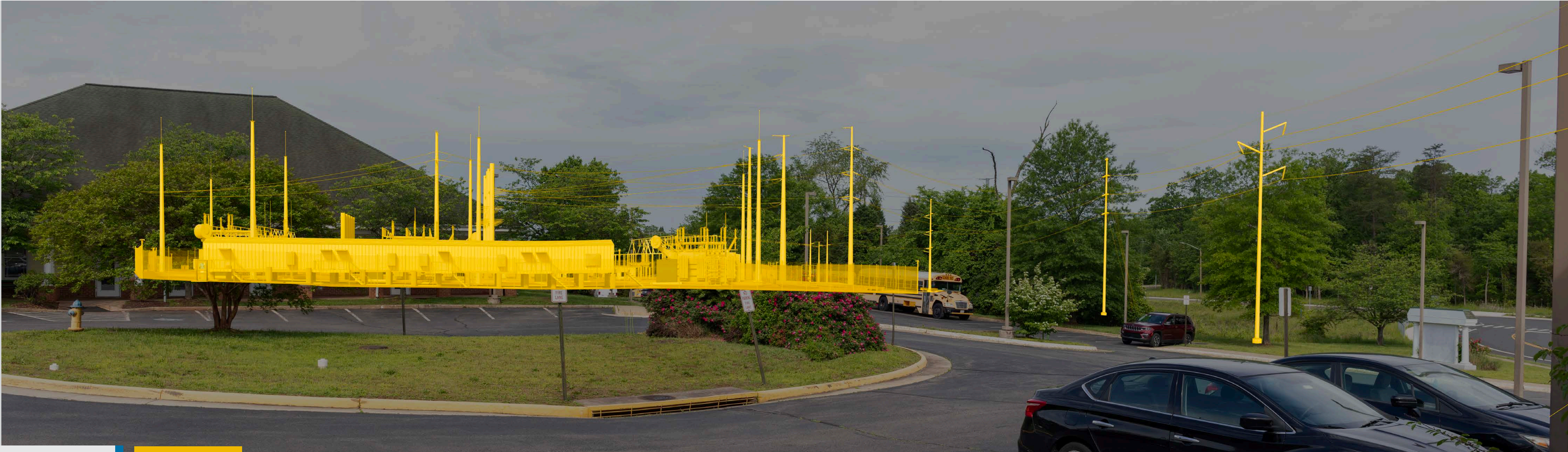
PROPOSED CONDITIONS OVERLAY

Structures displayed in yellow will be partially or fully obscured by buildings, vegetation, and terrain.