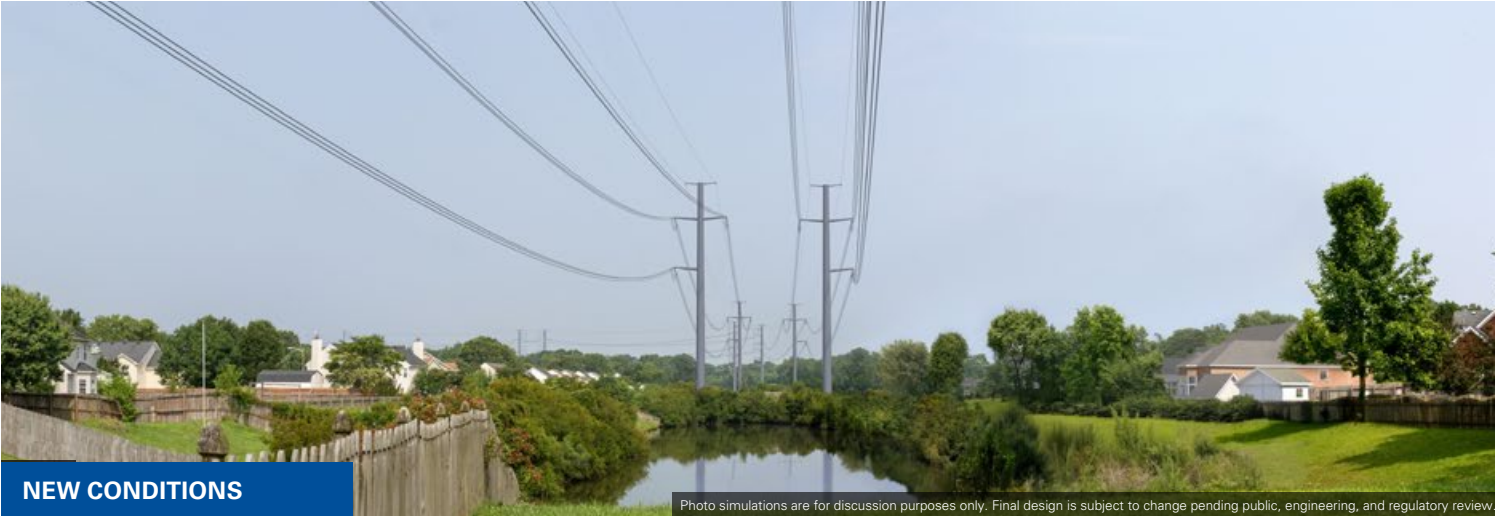
Photo simulations are for discussion purposes only. Final design is subject to change pending public, engineering, and regulatory review.