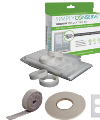
Simply Conserve® DIY Weatherization Kit