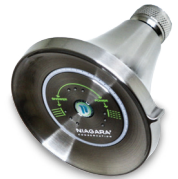
Niagara Conservation® Earth Luxe® Showerhead

Save on our Recessed and Outdoor Bundles too!