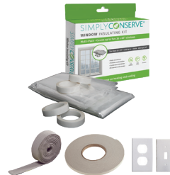
Simply Conserve® DIY Weatherization Kit