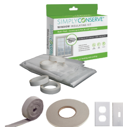
Simply Conserve® DIY Weatherization Kit