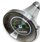
Niagara Conservation® Earth Luxe® Showerhead