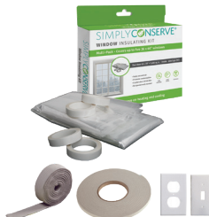
Simply Conserve® DIY Weatherization Kit