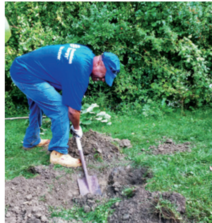
Dominion Energy Ohio employees volunteering in Twinsburg, Ohio.