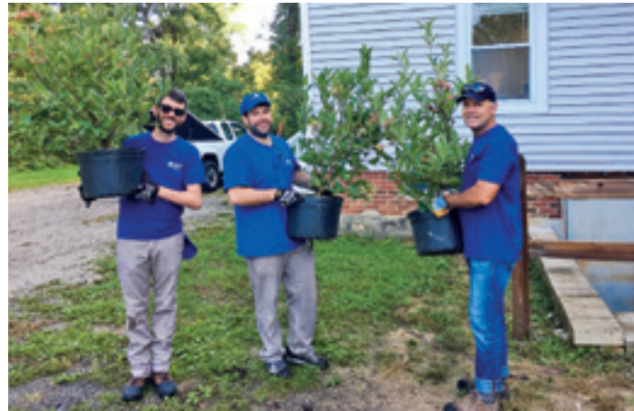
Volunteers pose with young trees to be planted near the Tinker's Creek Watershed Partners' Twinsburg, Ohio, headquarters.

Dominion Energy Ohio employees from several northeast Ohio offices planted trees, shrubs and other plants on the grounds of Tinker's Creek Watershed Partners' Twinsburg, Ohio, headquarters.