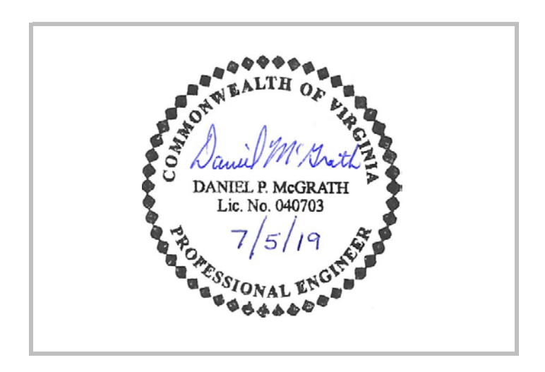
Engineer seal, signature and date

I certify that the inspection of the above listed CCR surface impoundment was conducted in conformance with the requirements listed in 40 CFR 257.83, and with generally accepted good engineering practices.