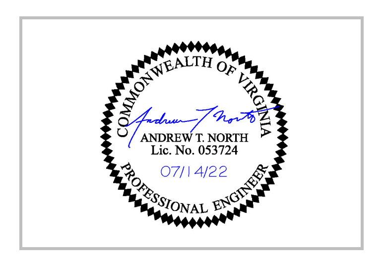
Engineer seal, signature and date

I certify that the inspection of the above listed CCR surface impoundment was conducted in conformance with the requirements listed in 40 CFR 257.83, and with generally accepted good engineering practices.