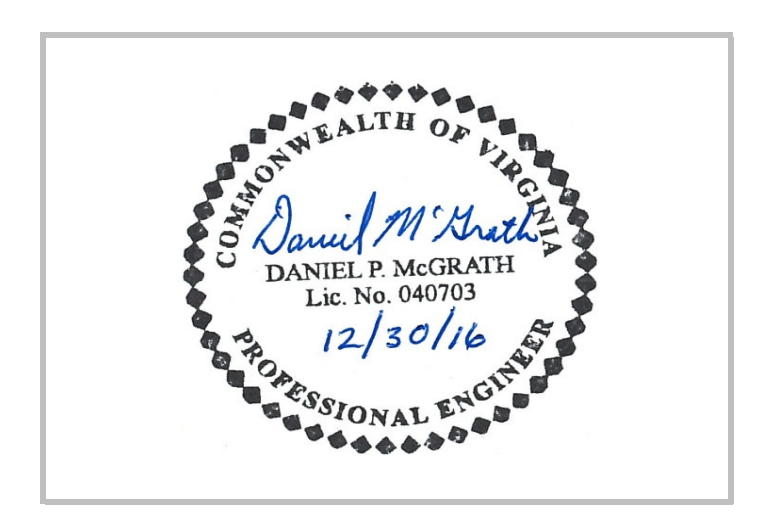
Engineer seal, signature and date

I certify that the inspection of the above listed CCR surface impoundment was conducted in conformance with the requirements listed in 40 CFR 257.83, and with generally accepted good engineering practices.