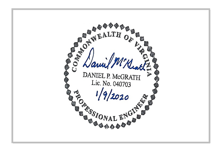
Engineer seal, signature and date

I certify that the inspection of the above listed CCR surface impoundment was conducted in conformance with the requirements listed in 40 CFR 257.83, and with generally accepted good engineering practices.