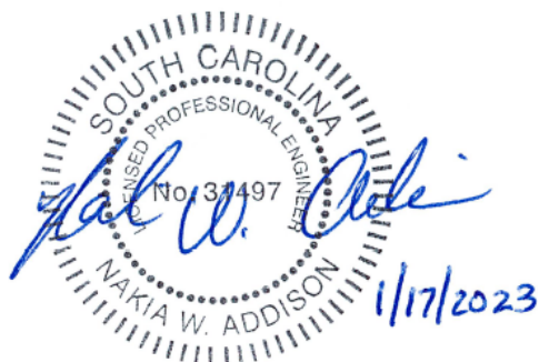
Engineer seal, signature and date

I certify that the inspection of the above listed CCR landfill was conducted in conformance with the requirements listed in 40 CFR 257.84, and with generally accepted good engineering practices.