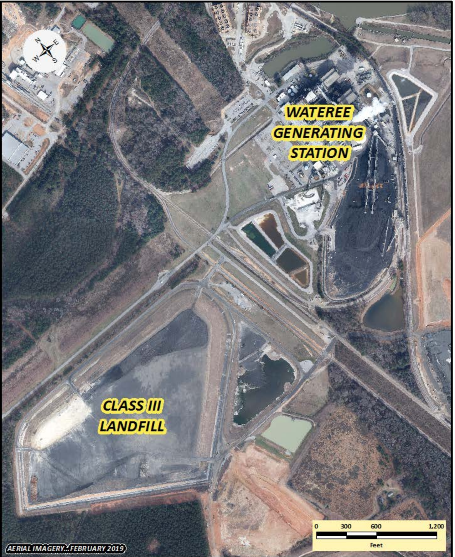
FIGURE 1 - SITE LOCATION Wateree Station Landfill