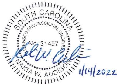
Engineer seal, signature and date

I certify that the inspection of the above listed CCR landfill was conducted in conformance with the requirements listed in 40 CFR 257.84, and with generally accepted good engineering practices.