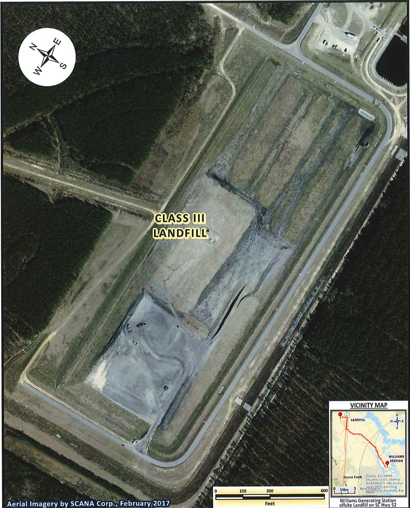
Figure 1 – Site Location Williams Station Hwy 52 Landfill