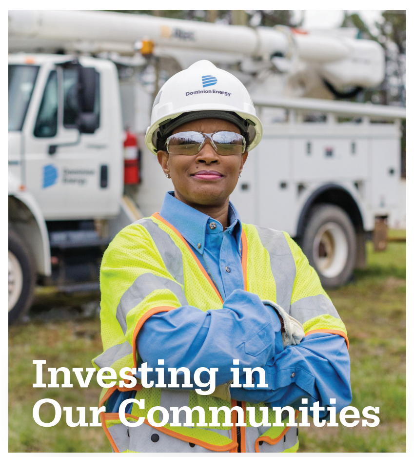
Dominion Energy image. Not project specific.