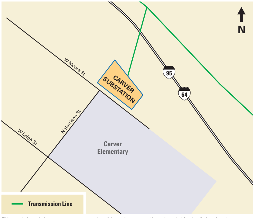
This map is intended to serve as a representation of the project area and is not intended for detailed engineering purposes.

Protecting the grid against natural and man-made acts is a top priority. You can learn more about our commitment to safety at powerlines101.dominionenergy.com.