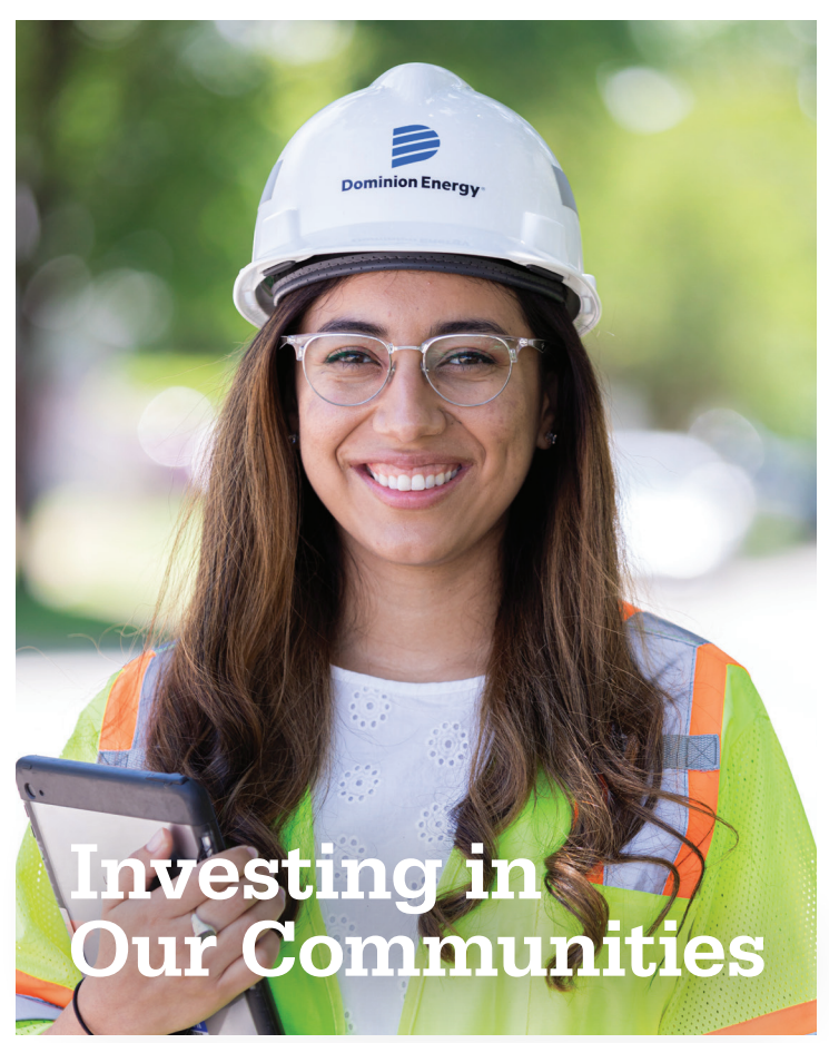
Dominion Energy image. Not project specific.