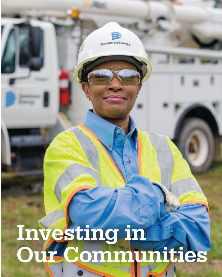
Not project specific.