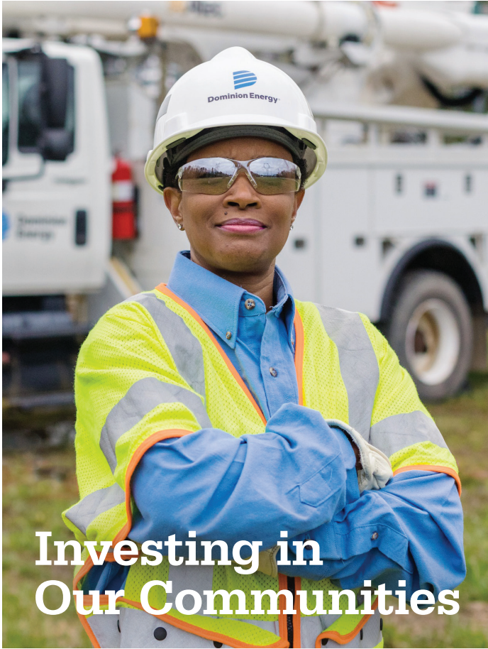
Not project specific.