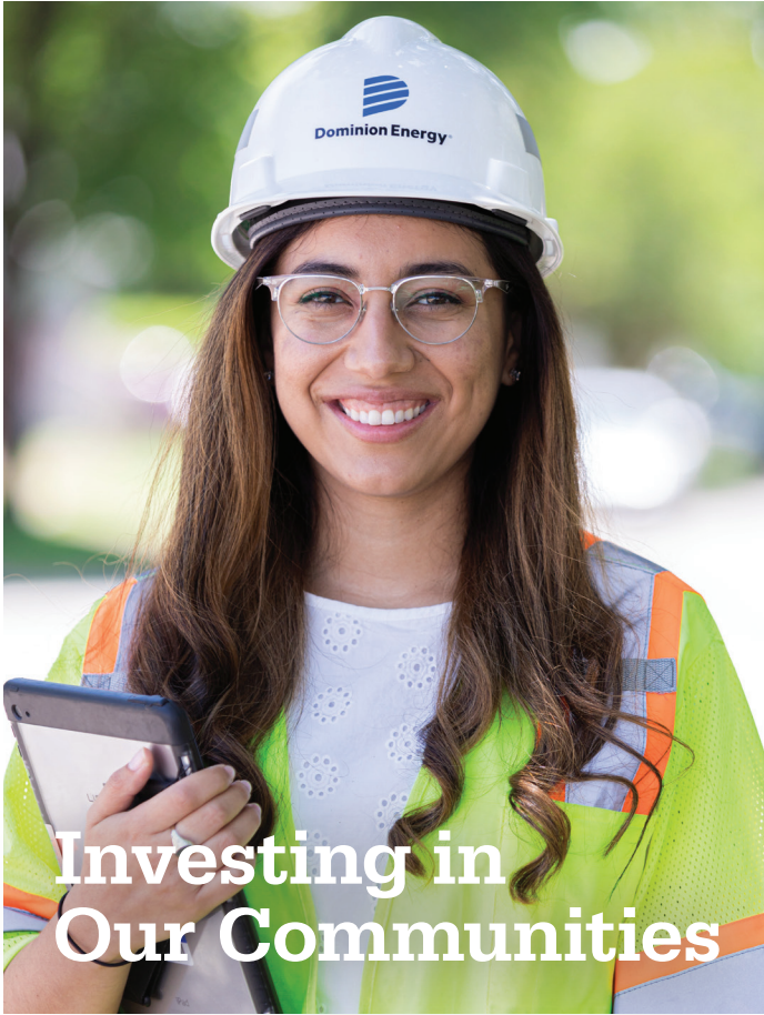
Not project specific.