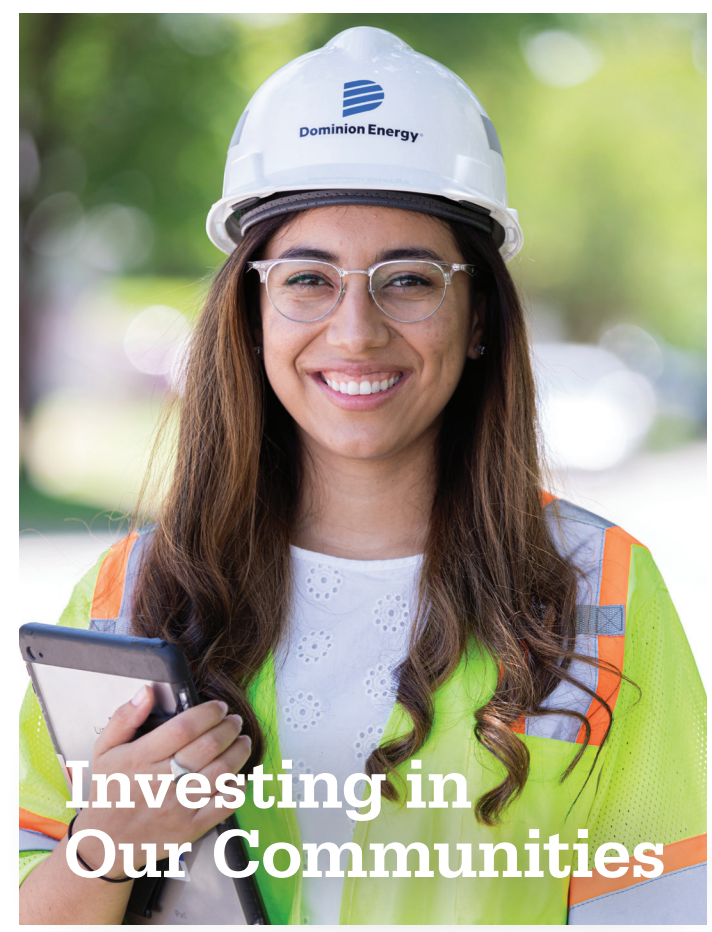
Not project specific.