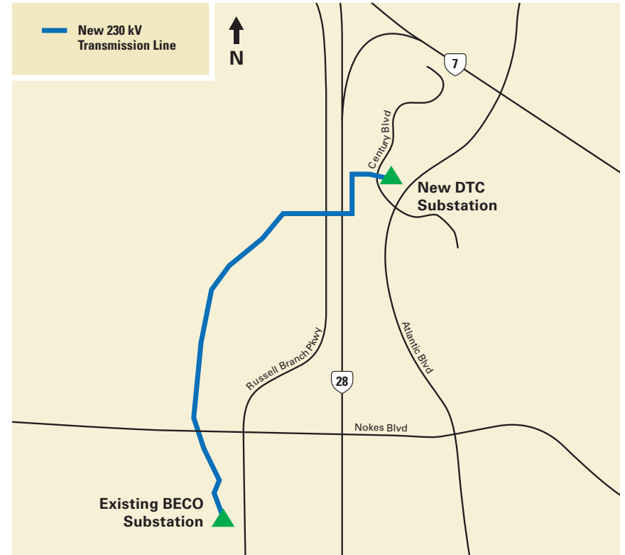
This map is intended to serve as a representation of the project area and is not intended for detailed engineering purposes.

For more information about this project, visit DominionEnergy.com/DTC . Or contact us by sending an email to powerline@dominionenergy.com or calling 888-291-0190.