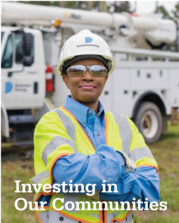
Not project specific.