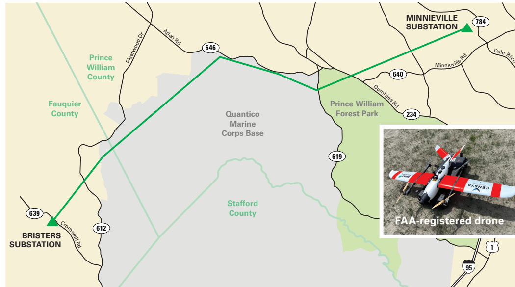
This map is intended to serve as a representation of the project area and is not intended for detailed engineering purposes.

The upcoming drone activities will prepare us for the next phase of construction activities, which will begin in late 2024. Thank you for your patience.