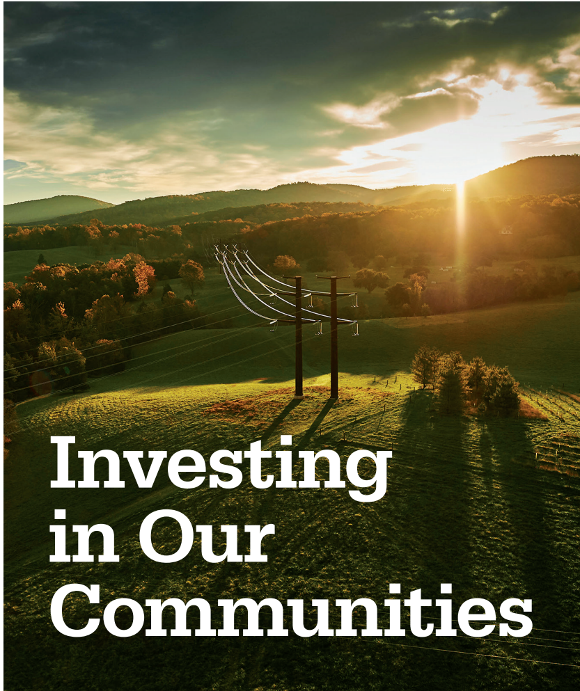
Not project specific.

Electric Transmission P.O. Box 26666 Richmond, VA 23261