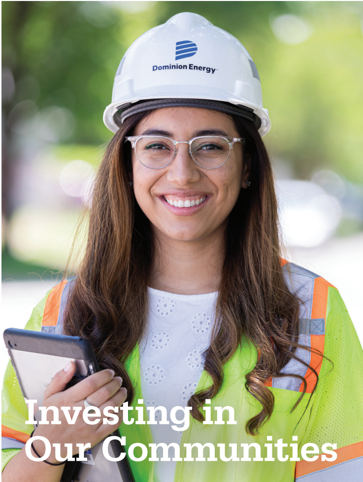
Dominion Energy image. Not project specific.