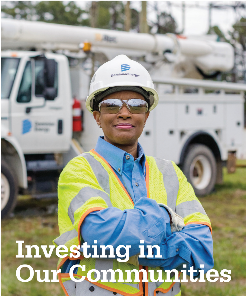
Not project specific.