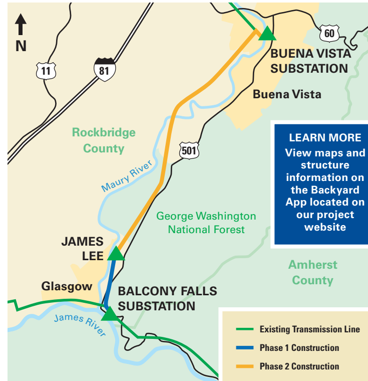
This map is intended to serve as a representation of the project area and is not intended for detailed engineering purposes.

Protecting the grid against natural and man-made acts is a top priority. You can learn more about our commitment to safety at powerlines101.dominionenergy.com .