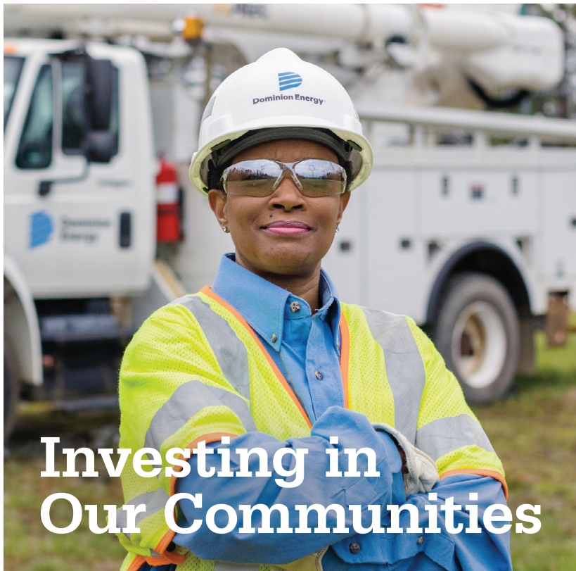
Dominion Energy image. Not project specific.