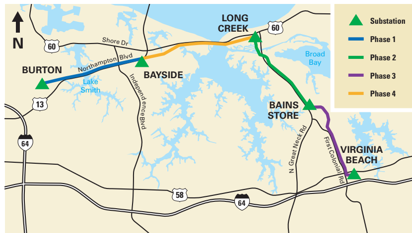
This map is intended to serve as a representation of the project area and is not intended for detailed engineering purposes.

We will update you as this project progresses. Thank you for your patience and understanding as we work to maintain electric reliability for all our customers.