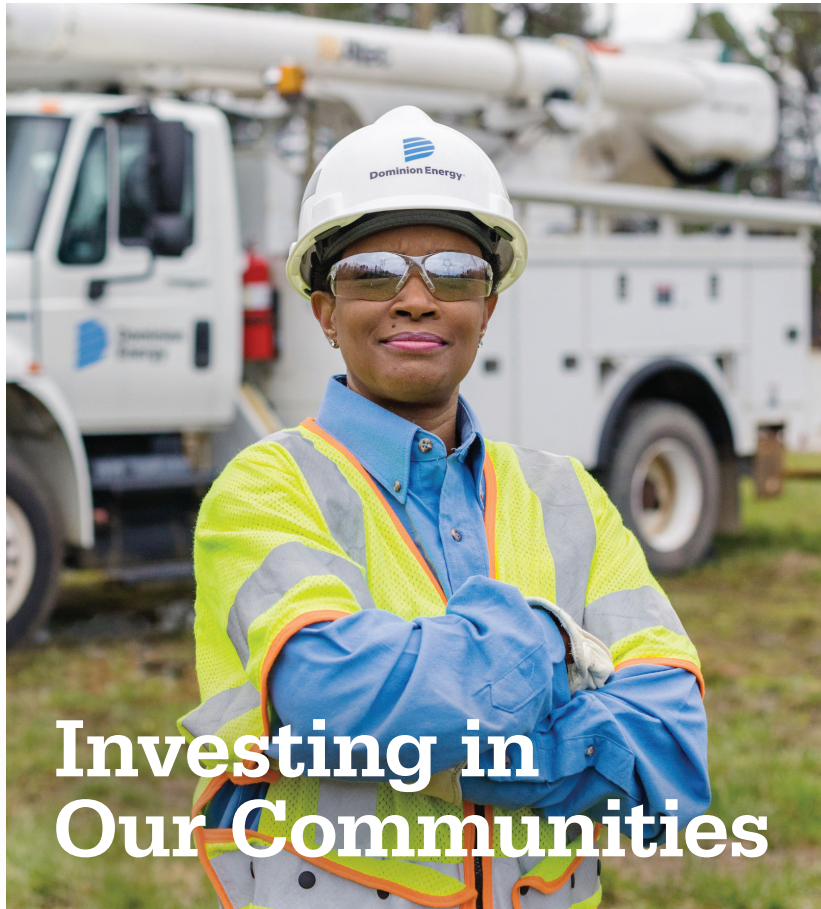
Not project specific.