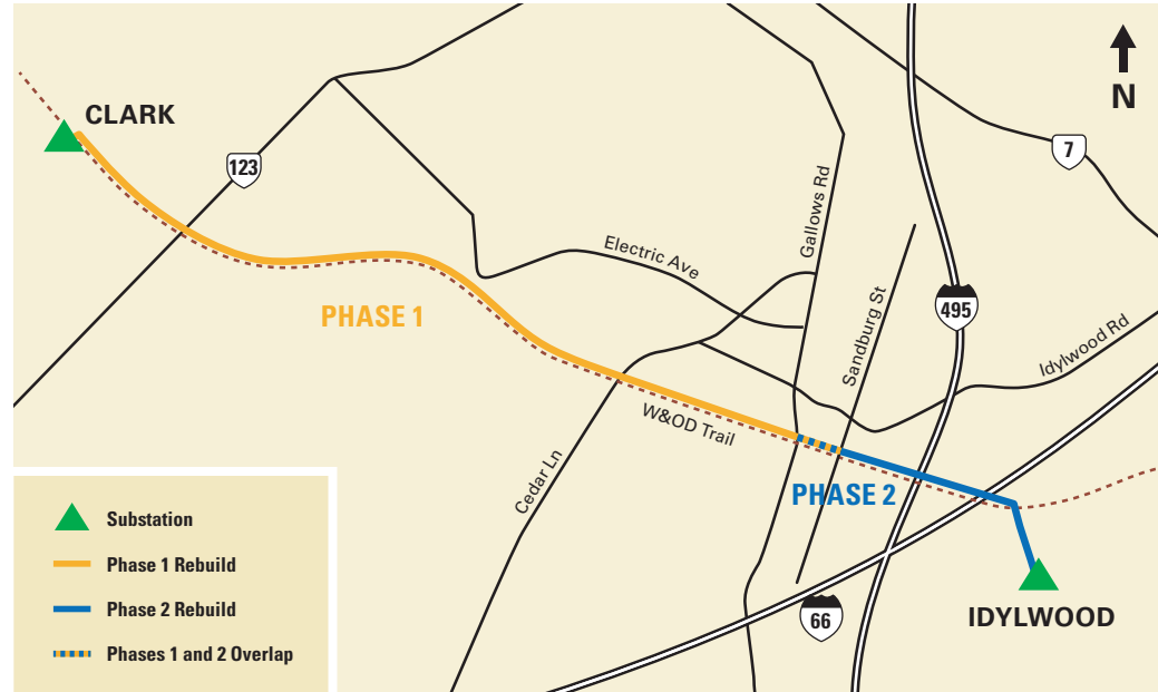
This map is intended to serve as a representation of the project area and is not intended for detailed engineering purposes.

Protecting the grid against natural and man-made acts is a top priority. You can learn more about our commitment to safety at powerlines101.dominionenergy.com .