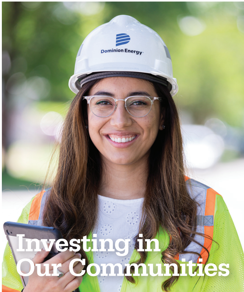
Dominion Energy image. Not project specific.