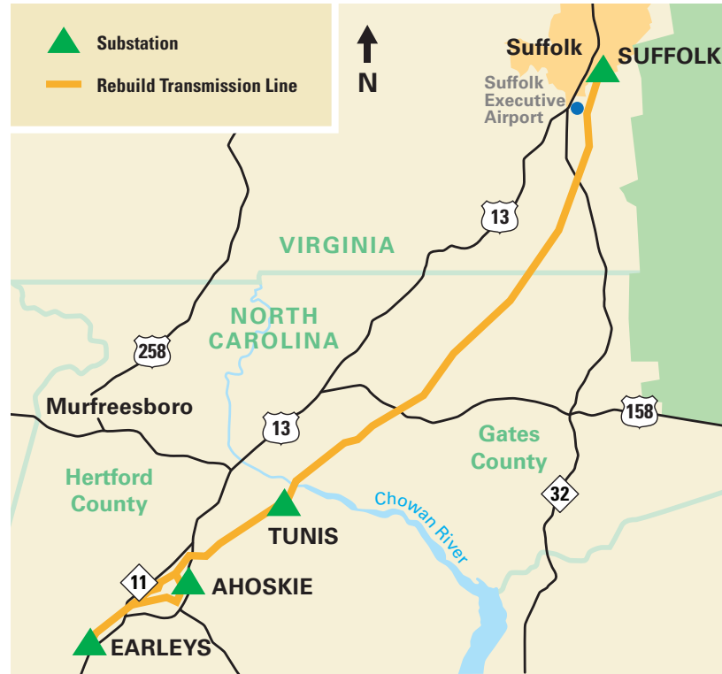
This map is intended to serve as a representation of the project area and is not intended for detailed engineering purposes.

Protecting the grid against natural and man-made acts is a top priority. You can learn more about our commitment to safety at powerlines101.dominionenergy.com .