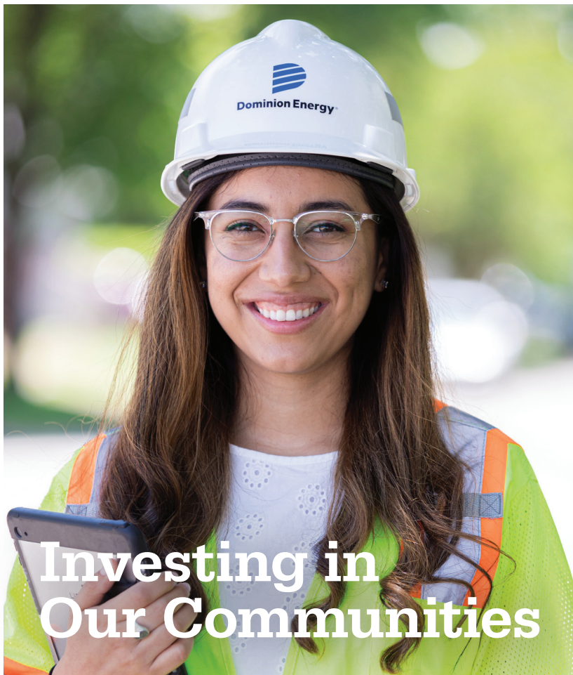
Not project specific.