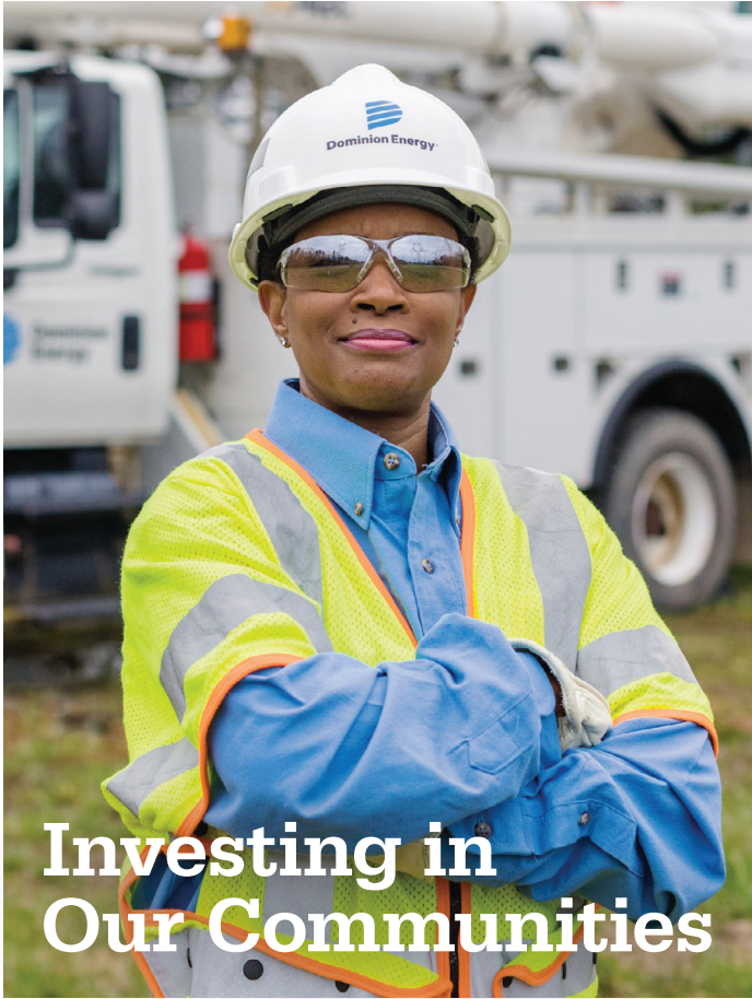
Not project specific.