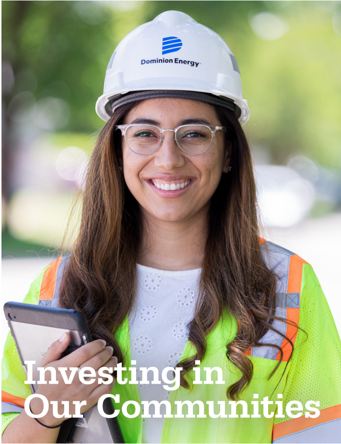
Not project specific.