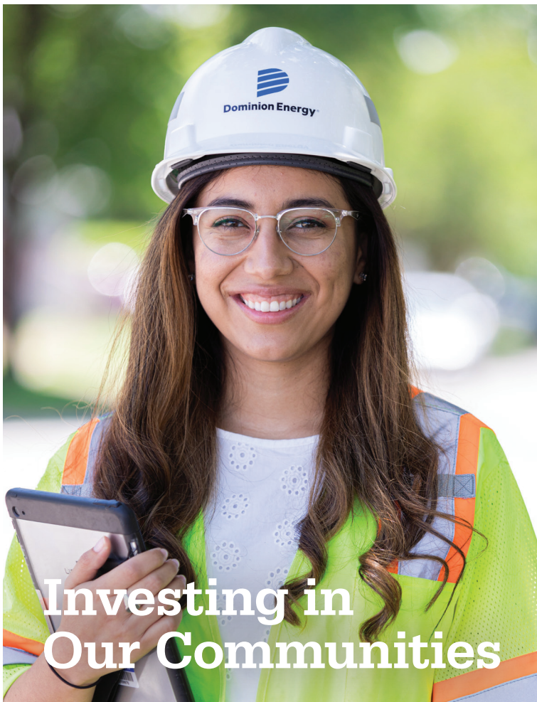
Not project specific.