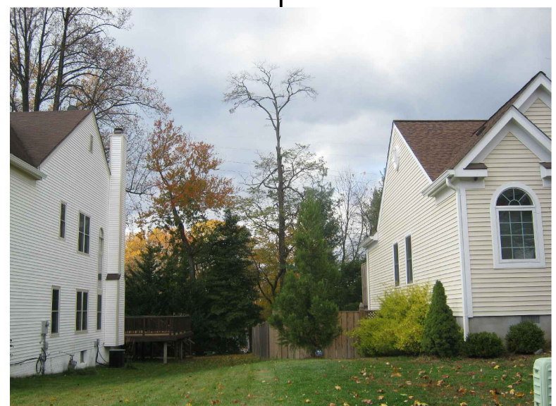
2564/2562 HOLLY MANOR DRIVE