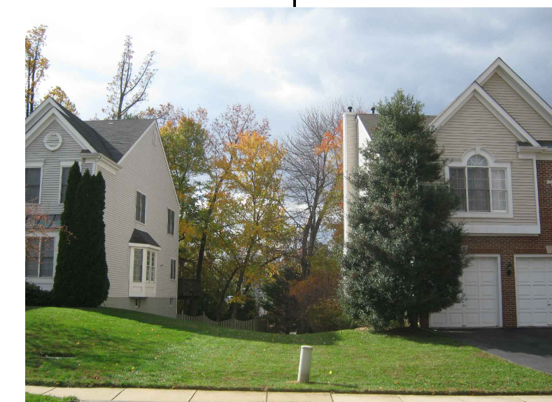
2552/2550 HOLLY MANOR DRIVE