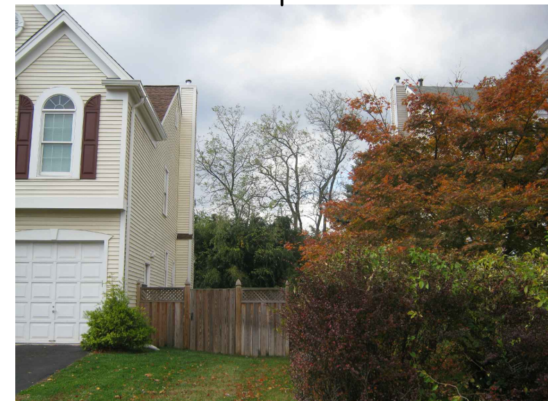
2562 HOLLY MANOR DRIVE