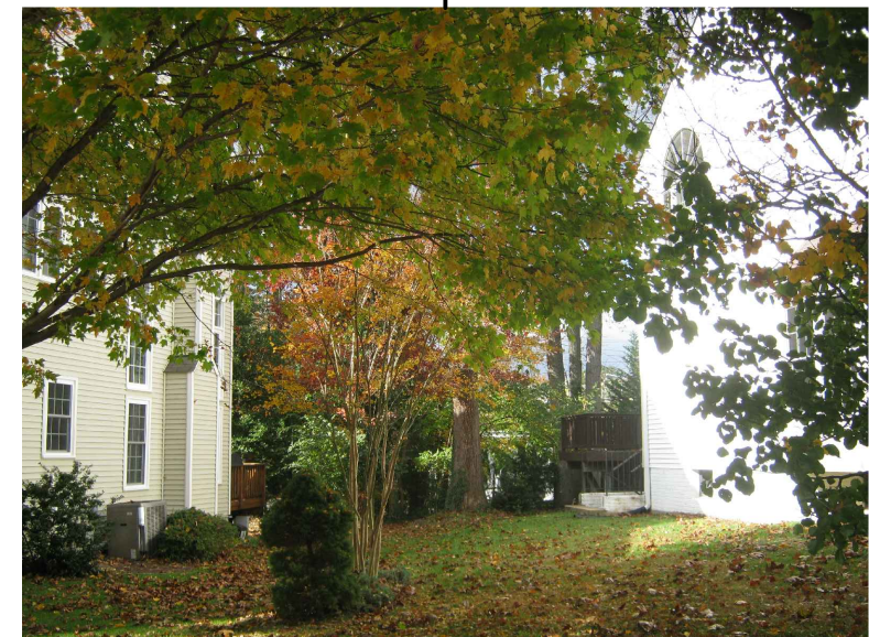
2568/2564 HOLLY MANOR DRIVE