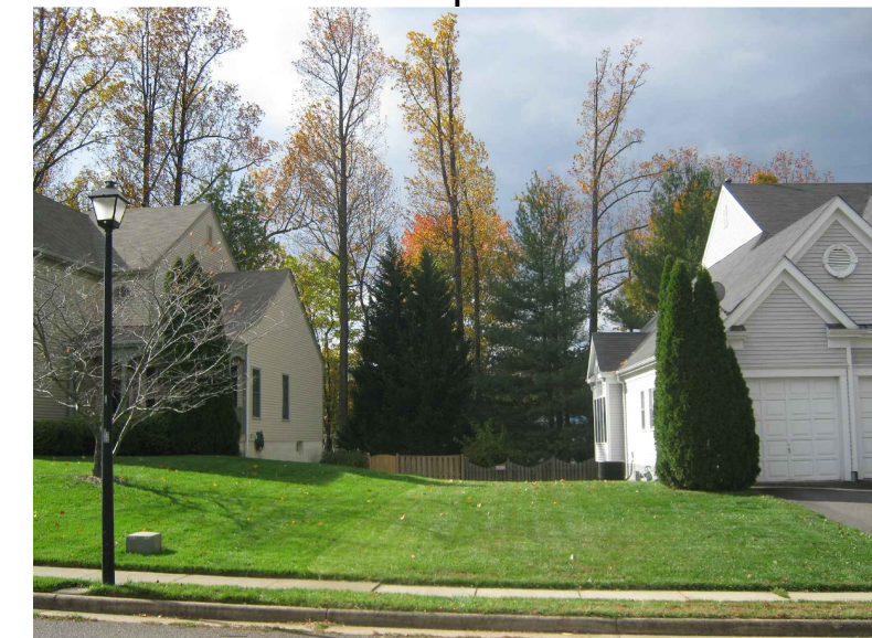
2554/2552 HOLLY MANOR DRIVE