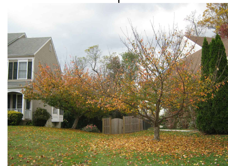
2560/2558 HOLLY MANOR DRIVE