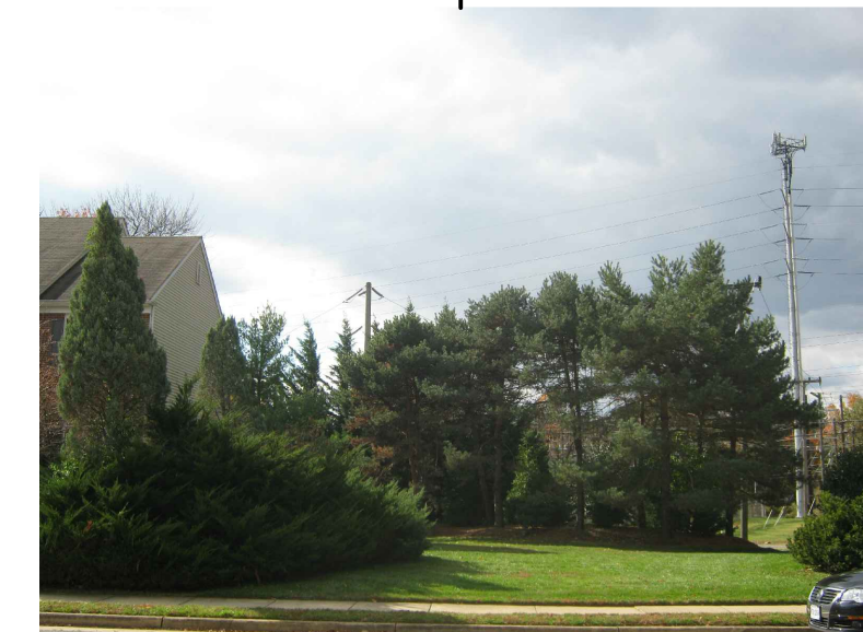
2550 HOLLY MANOR DRIVE