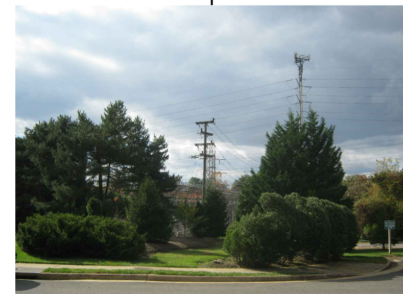
HOLLY MANOR DRIVE/ SHREVE RD INTERSECTION