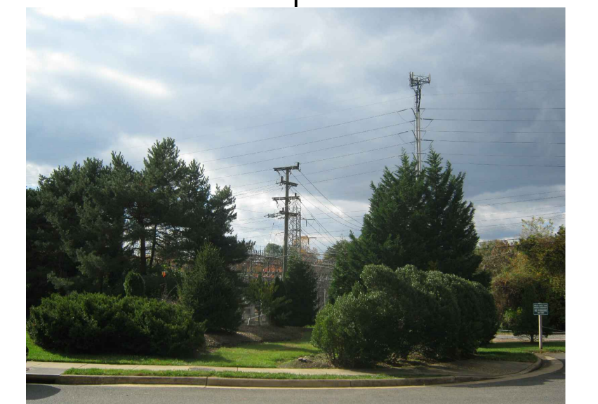
HOLLY MANOR DRIVE/ SHREVE RD INTERSECTION