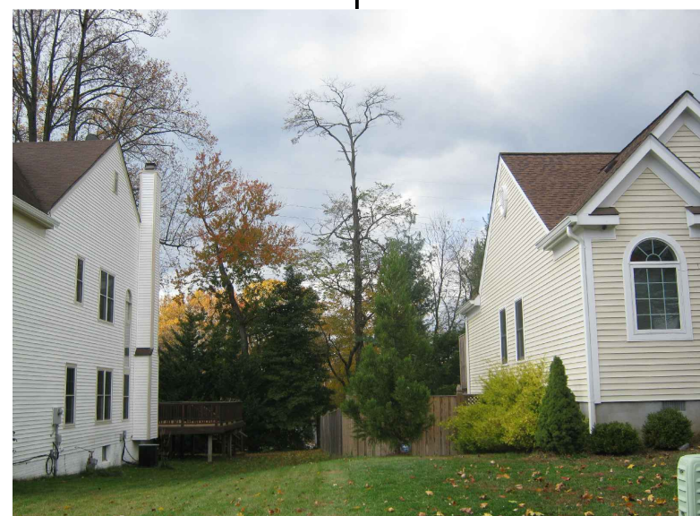
2564/2562 HOLLY MANOR DRIVE