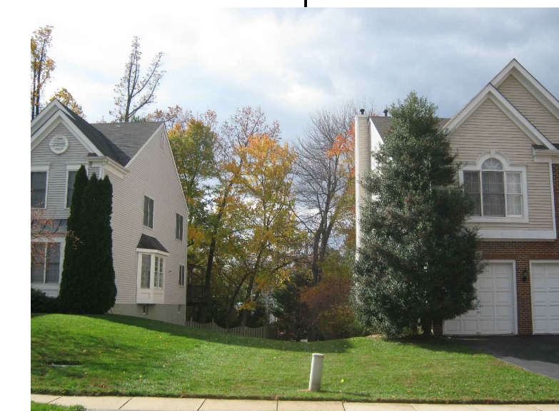
2552/2550 HOLLY MANOR DRIVE