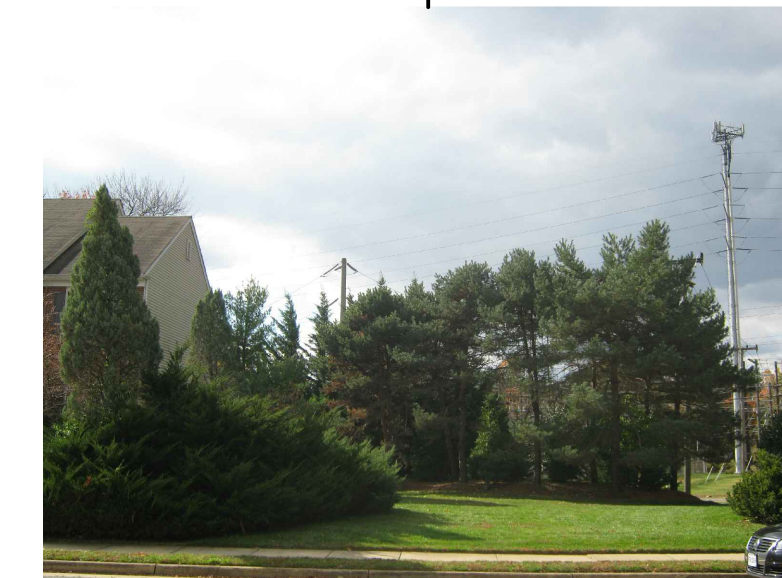
2550 HOLLY MANOR DRIVE