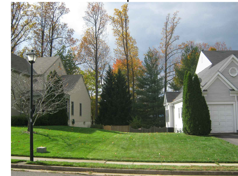
2554/2552 HOLLY MANOR DRIVE