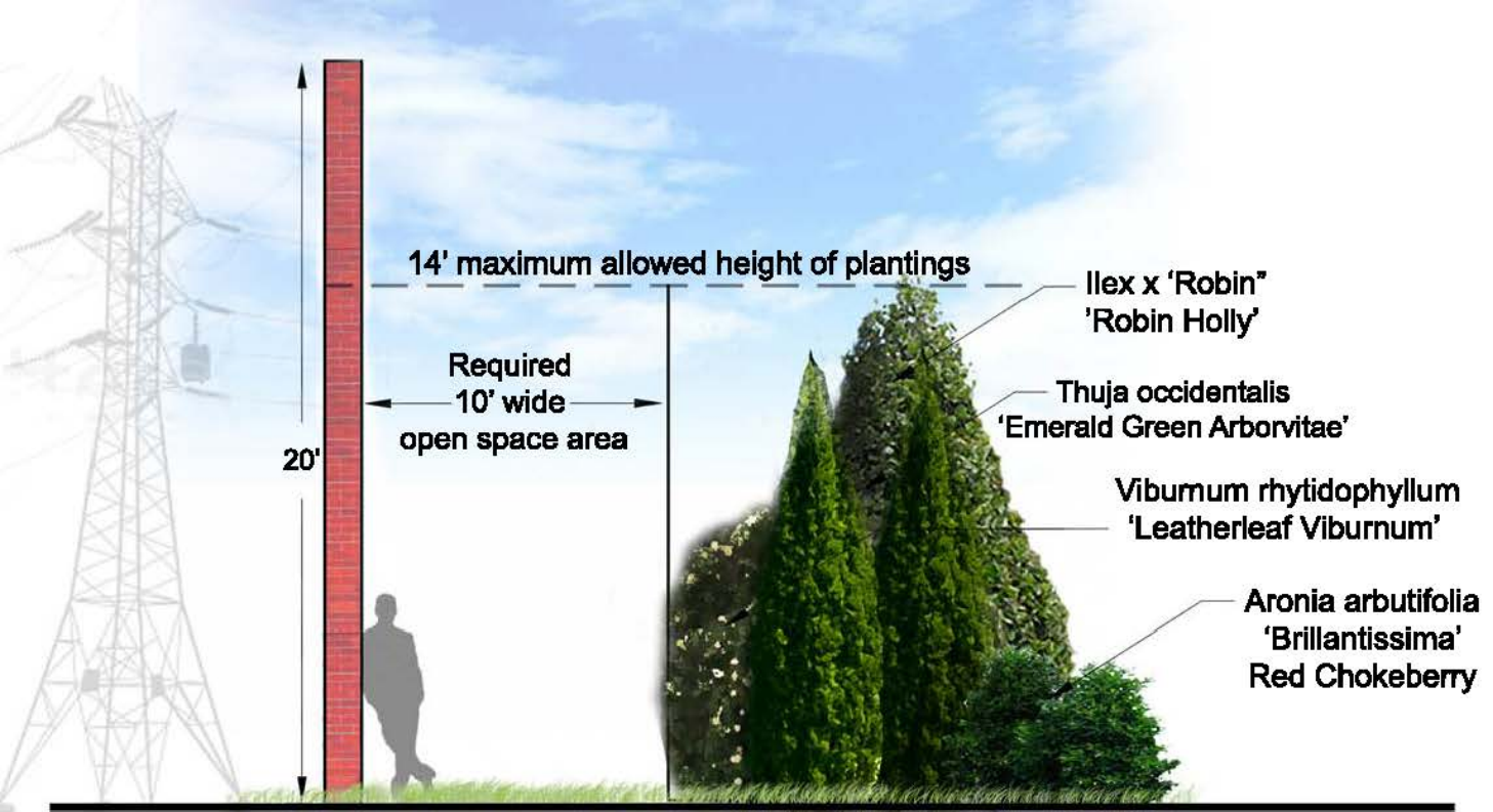
1 Transitional Screening Yard Side Elevation- Required 10' wide open space area Not to Scale