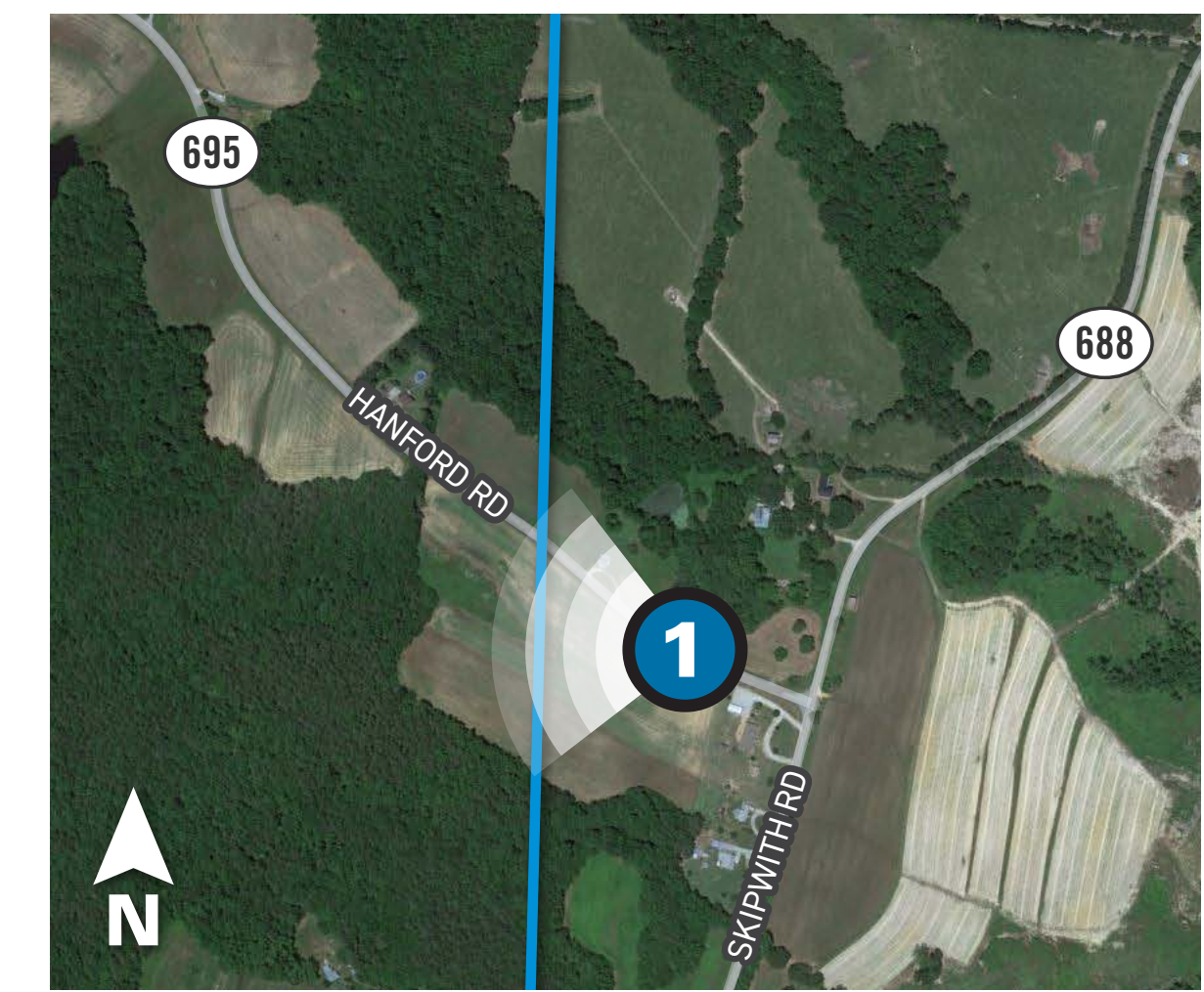
1 Viewpoint Location — Route Alternative 5

Visualization is for discussion purposes only. Final design is subject to change pending public, engineering, and regulatory review.