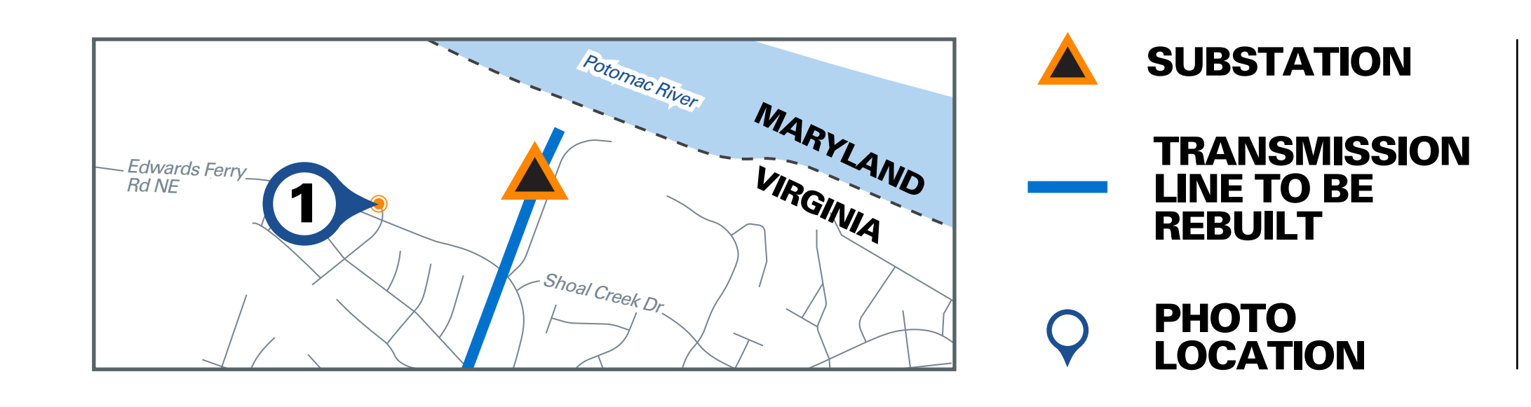
Photo simulations are for discussion purposes only. Final design is subject to change pending public, engineering, and regulatory review.