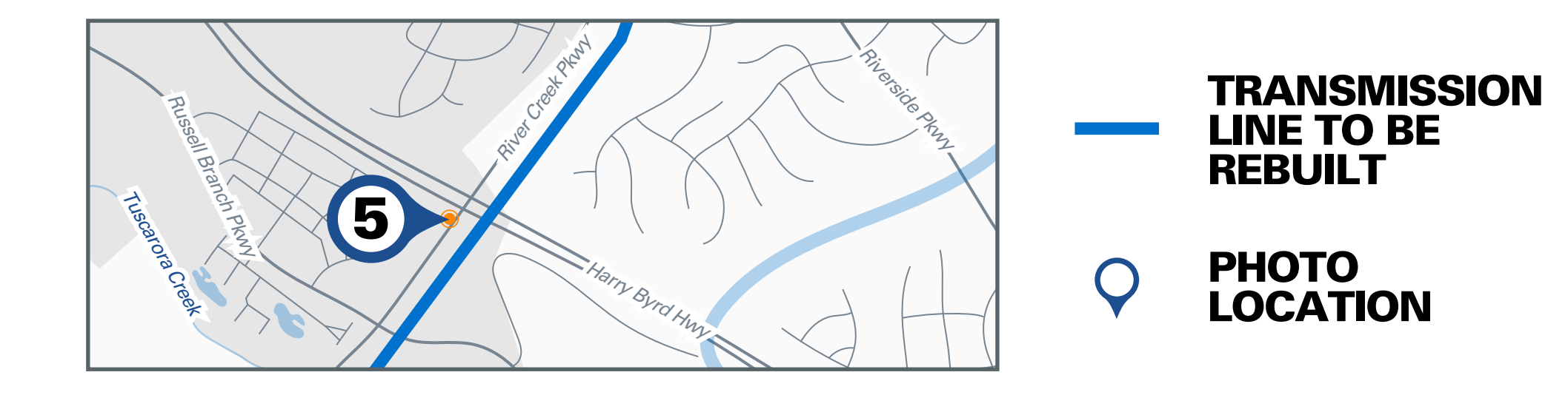
Photo simulations are for discussion purposes only. Final design is subject to change pending public, engineering, and regulatory review.