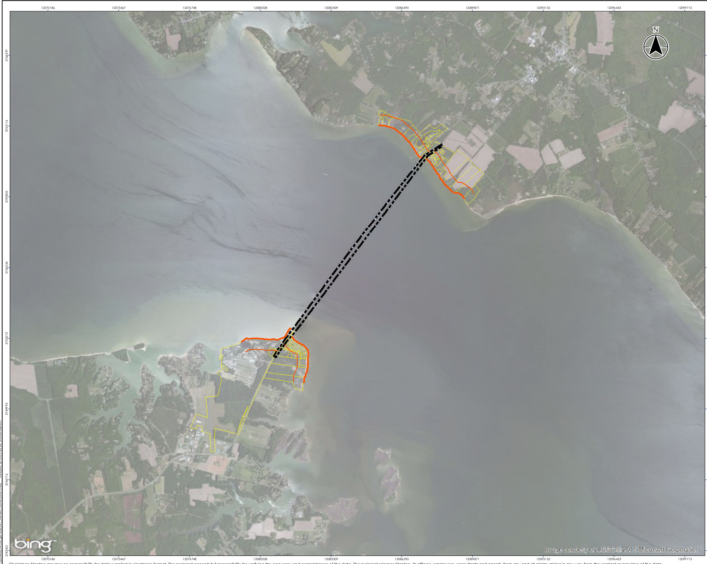
Figure No. 1 Title Notified Land Owners Map

Client/Project Dominion Virginia Power Line 65