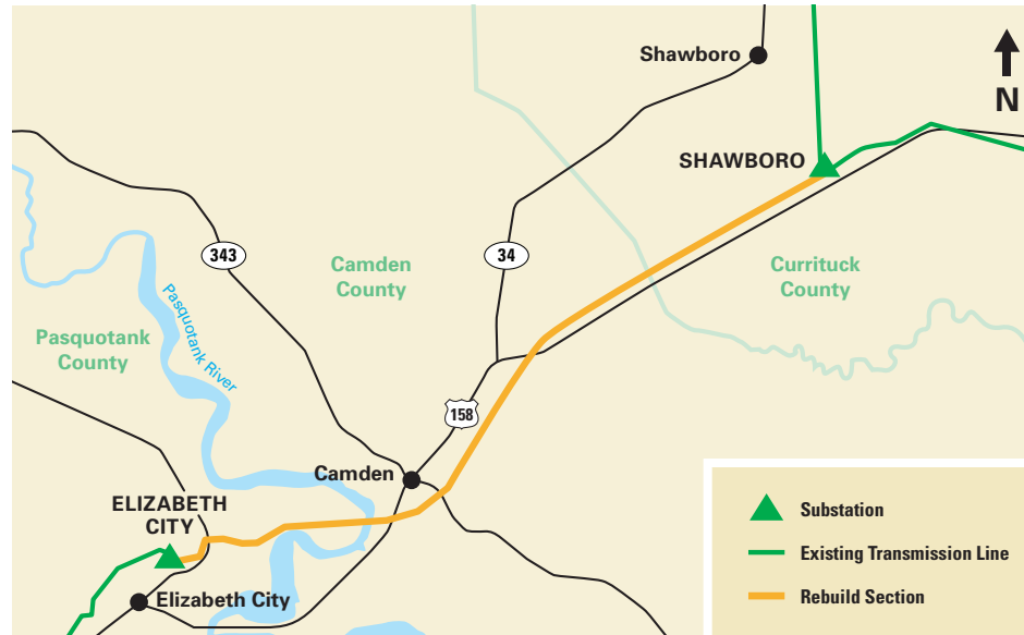
This map is intended to serve as a representation of the project area and is not intended for detailed engineering purposes.

We are dedicated to working safely and courteously in your community. Thank you for your patience while we complete this important reliability project.