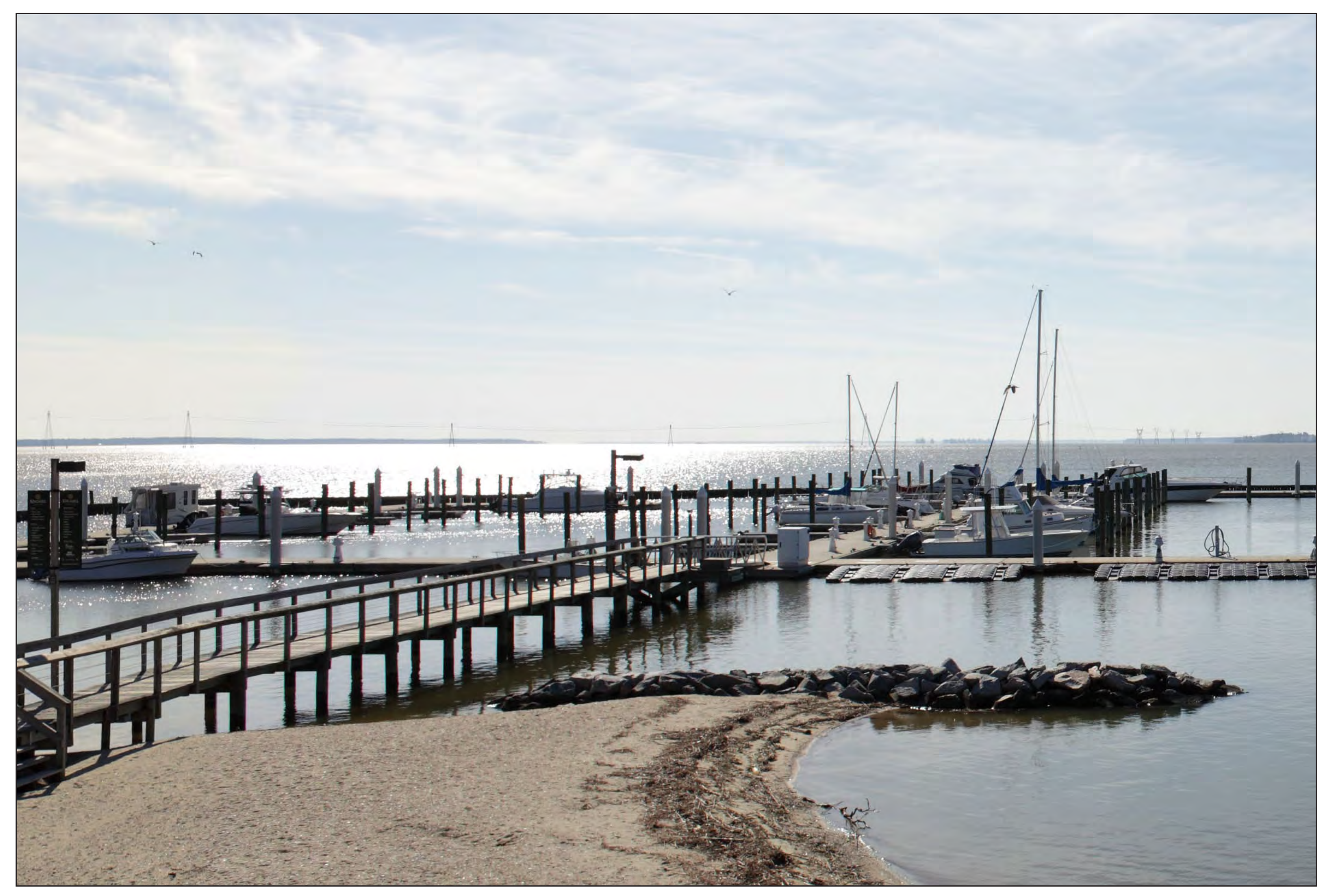
Viewpoint 10 - Kingsmill Resort and Golf Club from Dock Area - Looking South - James River Crossing Variation 1 - Proposed View Enlargement Area of previous page - enlarged to a representative view when printed on a 11 x 17 " page and viewed from approx. 20" distance.