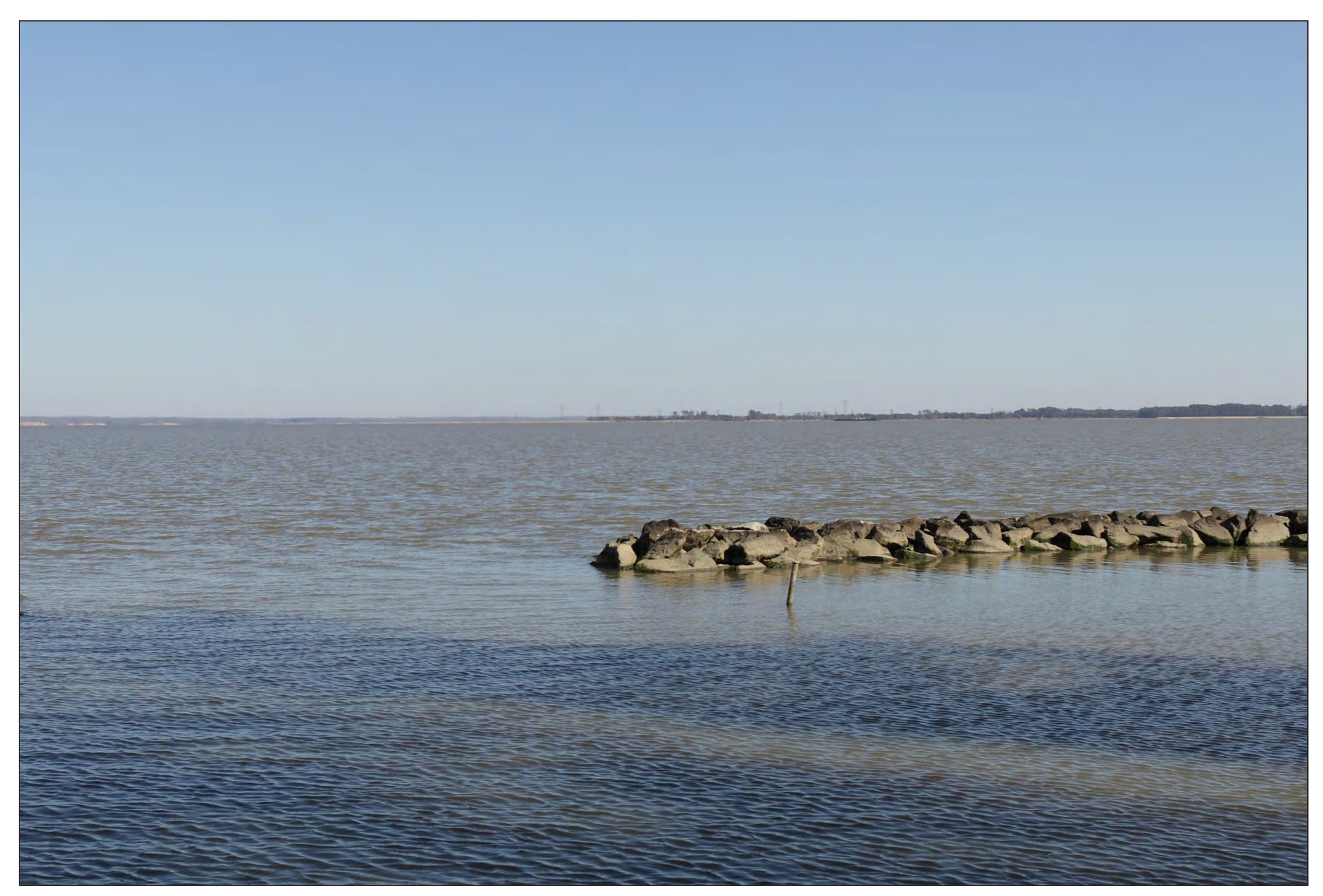
Viewpoint 12 - East End of Jamestown Island - Looking Southeast - James River Crossing Variation 1 - Proposed View Enlargement Area of previous page - enlarged to a representative view when printed on a 11 x 17 " page and viewed from approx. 20" distance.