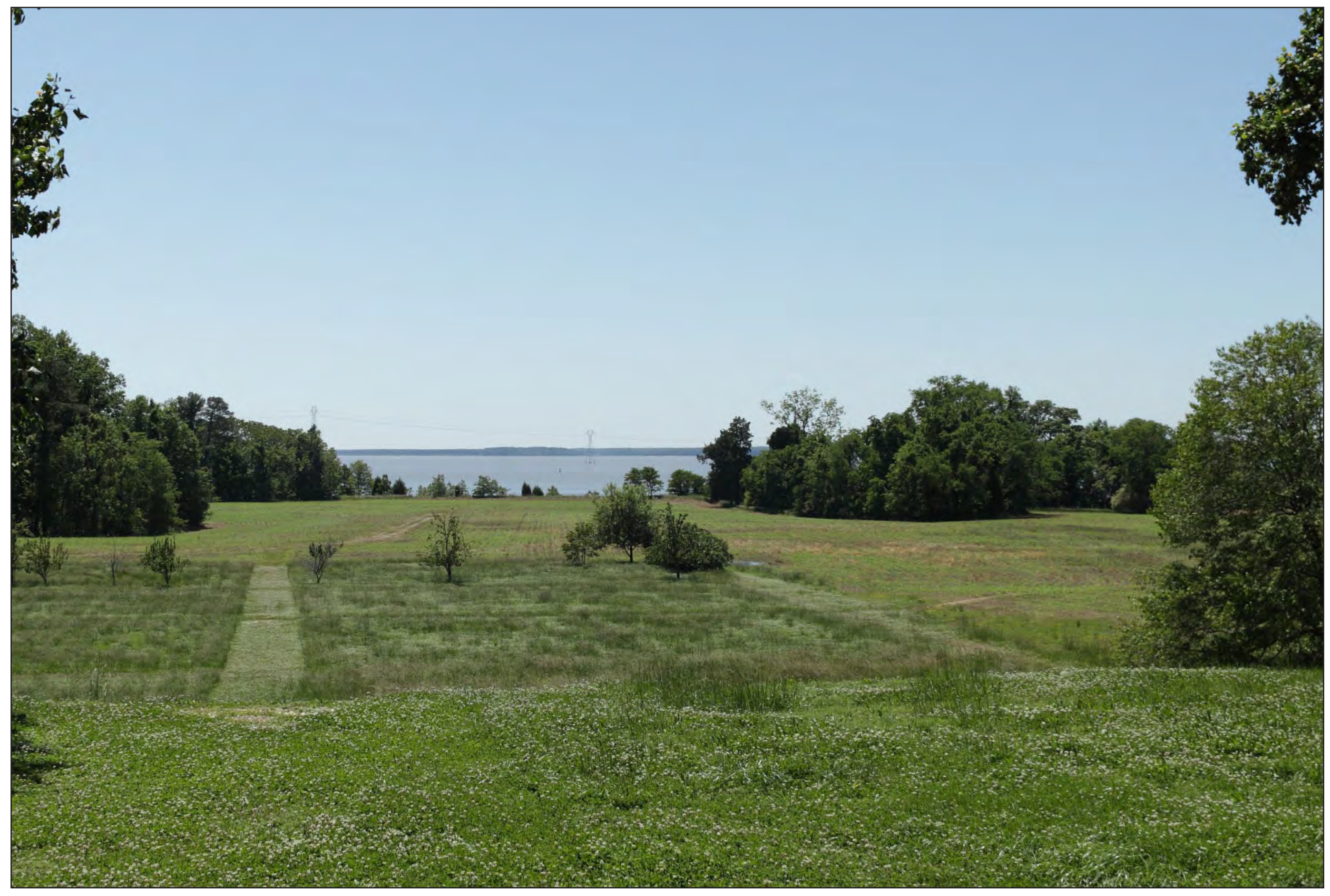
Viewpoint 15 - View from Main House at Carter's Grove - Looking Southwest – James River Crossing Variation 1 - Proposed View Enlargement Area of previous page - enlarged to a representative view when printed on a 11 x 17 " page and viewed from approx. 20" distance.