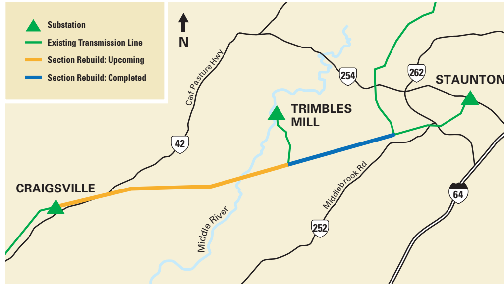
This map is intended to serve as a representation of the project area and is not intended for detailed engineering purposes.

The decision to reschedule this project will not impact the quality of your electric service, and the existing infrastructure remains safe and secure. We will continue to update you on the project as it progresses.