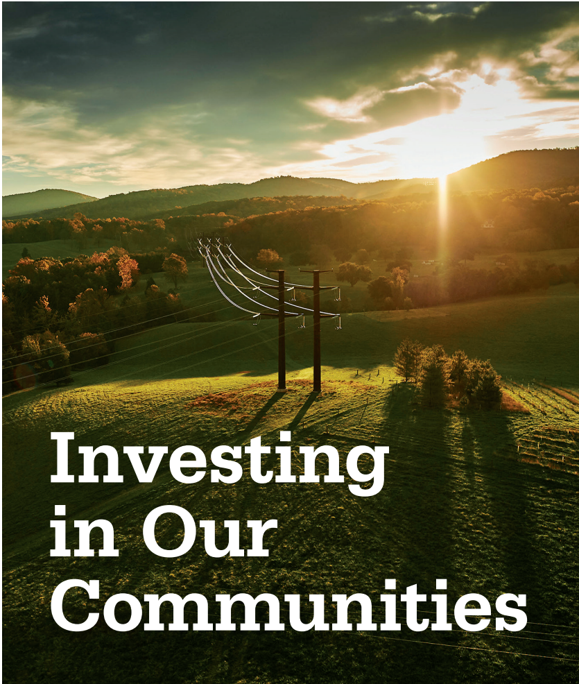
Dominion Energy image. Not project specific.

Electric Transmission P.O. Box 26666 Richmond, VA 23261